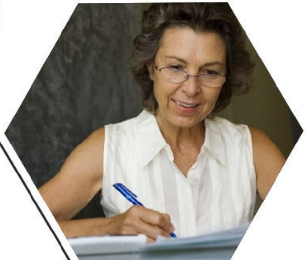
Convenient to old people